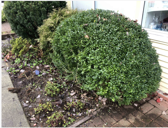
Less dense cover, further proximity